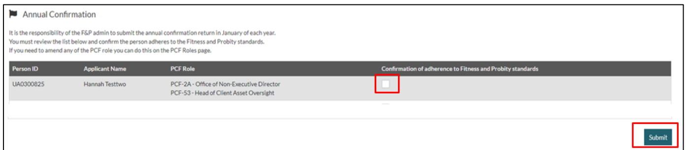
Fig 3.1 – Annual Confirmation

The user should navigate to the 'Annual Confirmation' Page of the Fitness and Probity Menu on the Portal. The user should review the list of PCF holders to ensure accuracy. The Admin must then tick to confirm adherence to the Fitness and Probity standards for each PCF function holder. The user will not be able to make the submission until all PCF holders have been selected as confirmed. Once they have confirmed adherence for all PCF holders the user must click 'submit' to complete the submission to the Central Bank.